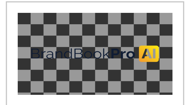
No inappropriate background