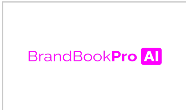
Do not modify the logo colors