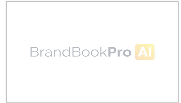
Do not change the opacity of the logo