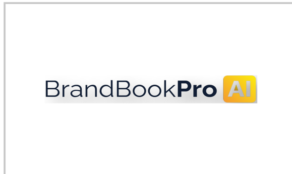
No effects or shadows