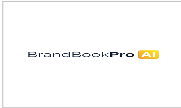
Do not distort, stretch or modify proportions