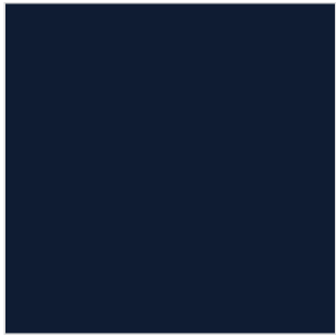
Deep Navy #101D34 RGB 16, 29, 52 CMJN 69%, 44%, 0%, 80%