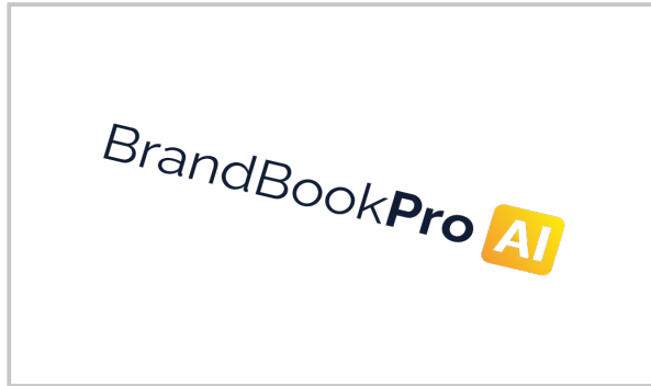
Do not rotate or tilt the logo