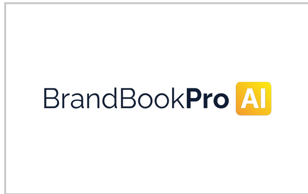
Logo on white background