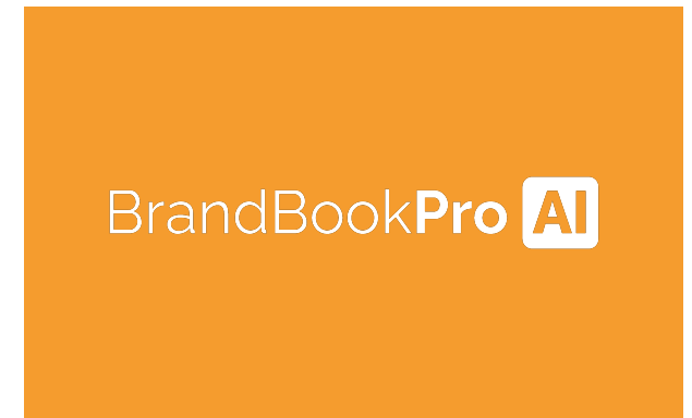
Logo on Solar Orange