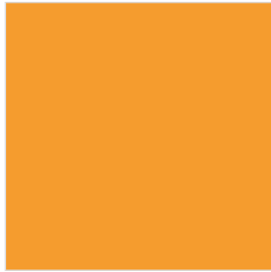
Solar Orange #F49B2E RGB 244, 155, 46 CMJN 0%, 36%, 81%, 4%