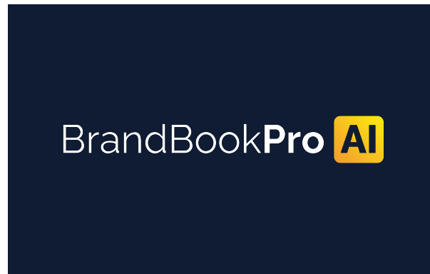
Logo on Deep Navy